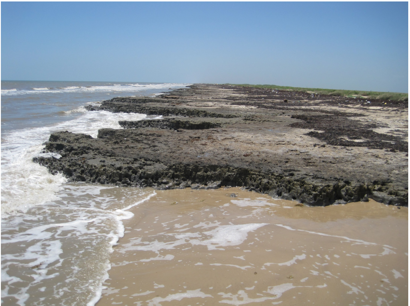
Clay Fingers. Effects of Clay Downcutting at McFaddin Beach

taken at McFaddin Beach along the McFaddin National Wildlife Refuge (NWR) in Jefferson County. The clay outcroppings are a geomorphic phenomena resulting from extreme erosion found along the 26 miles of the NWR, where the protective sand covering on the beach face has been stripped away and removed from the littoral system. The cross shore length varies from several feet to over 20 feet, and have an elevation of several inches to several feet.